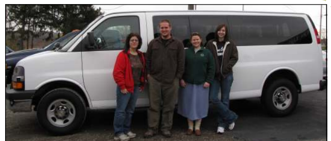
Several year-round staff in front of the camp’s new van.

Thanks to a generous donation Camp Luz now owns a 15 passenger van! The van will be used with the Outpost program for our off-site biking/canoeing and climbing/rappelling trips. We also plan on adding a couple Adventure Trips to the program line-up by 2011. The van opens up several new options for our program. Thank you to our generous donor and Kidron Kars for finding this vehicle for us!