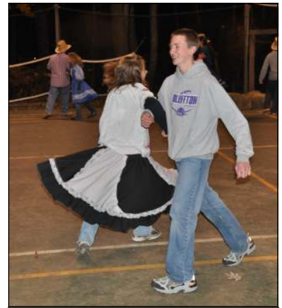
Youth square dancing Friday night at the youth retreat